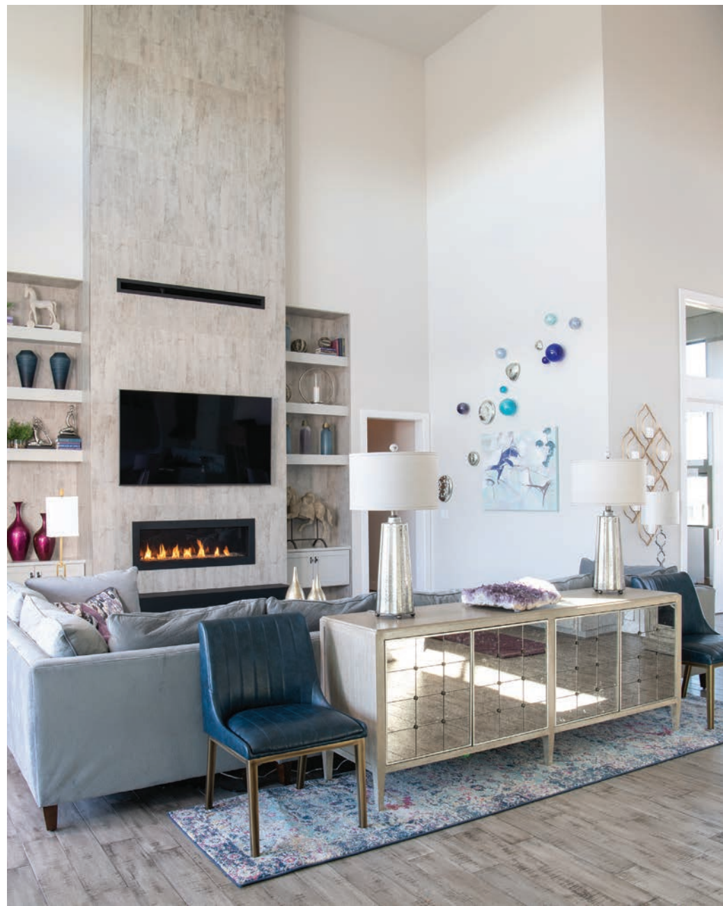
A mirror console from Hooker Furniture adds a bit of glamour to the main living room (left); several windows help bathe the study (opposite) in sunlight; a custom wood piece featuring the Torchy's Tacos mascot graces a wall in the media room (bottom); artwork, accessories and architectural pieces add character throughout the home.