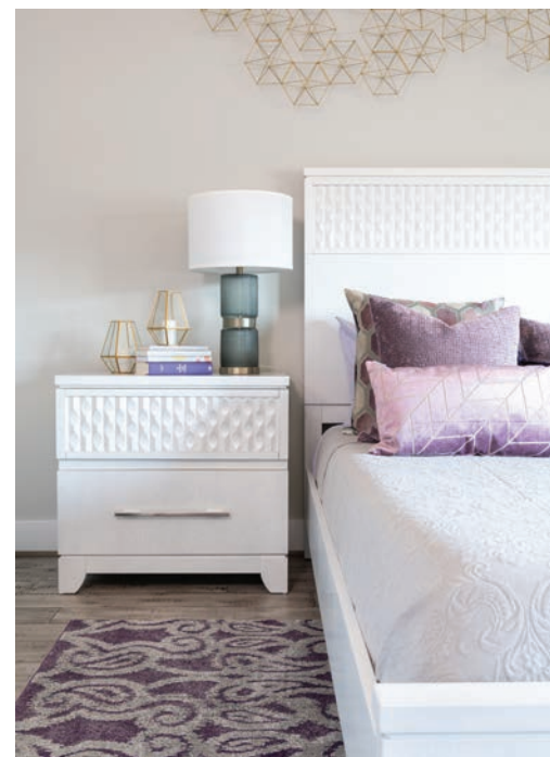
The master bedroom (top) has a tiled fireplace and a bed from Bernhardt Furniture; Myah’s bedroom (right) has a teal color scheme while a guest bedroom (near left) has a purple one; a built-in cabinet provides storage in the study (opposite top); a mix of textures is evident throughout the house, including a guest bedroom (far left).