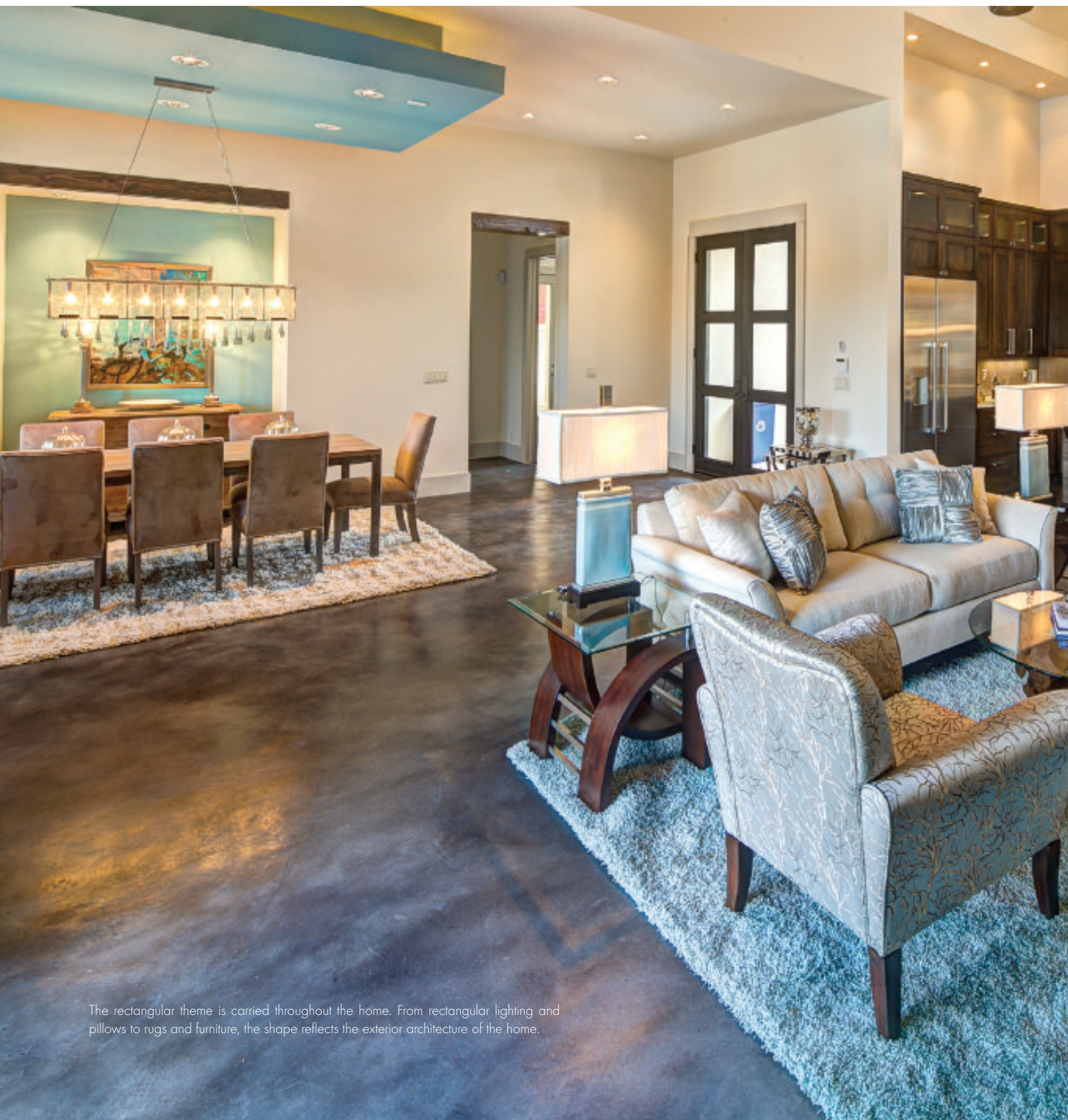
The rectangular theme is carried throughout the home. From rectangular lighting and pillows to rugs and furniture, the shape reflects the exterior architecture of the home.