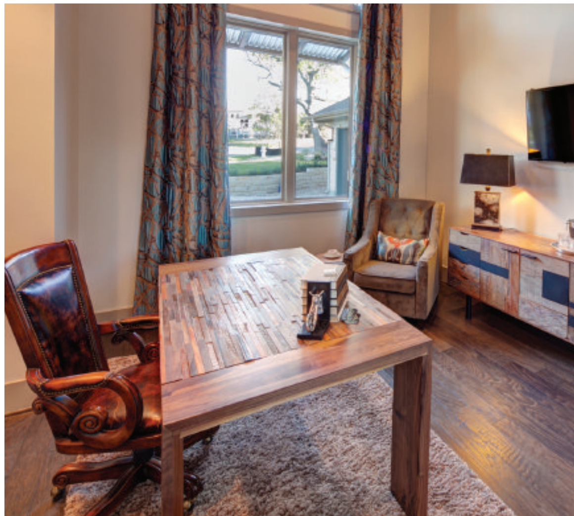
The study's desk is made from reclaimed wood. "It brings in texture," Bond says.

is a single story, 3,400-square-foot home sitting on more than an acre that backs up to a Do Not Disturb area, which means no one can build on the land behind the house—the views are preserved forever.