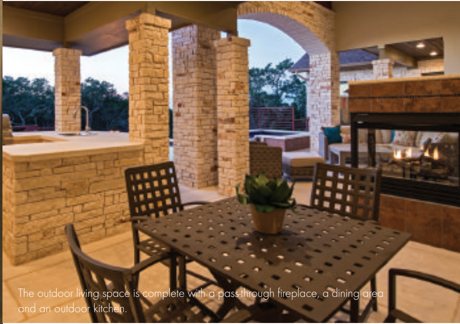
The outdoor living space is complete with a pass-through fireplace, a dining area and an outdoor kitchen.