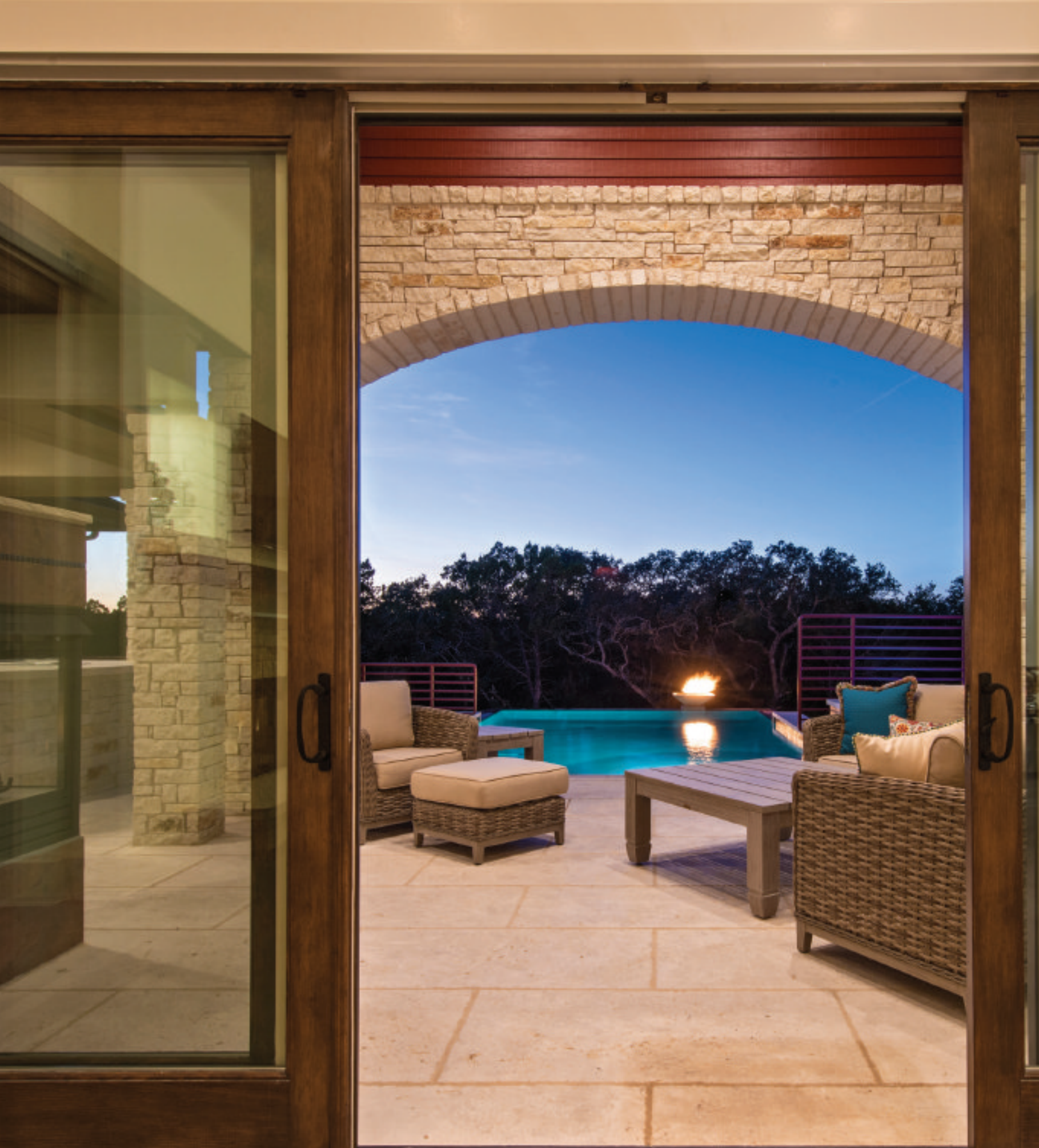
The juxtaposition of the pool and the fire feature creates the fire-and-ice concept Durio envisioned for the outdoor living space.